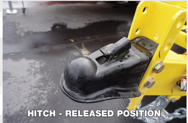
HITCH - RELEASED POSITION