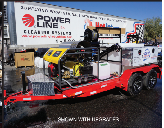
SHOWN WITH UPGRADES

Premium Quality = More Years of Service = BEST RETURN ON INVESTMENT