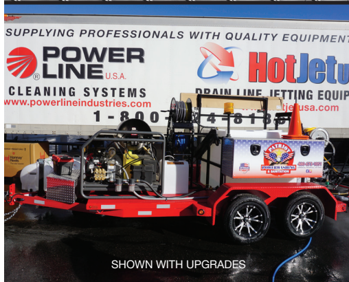
SHOWN WITH UPGRADES

Gas Engine • Diesel Heated HOT/COLD/STEAM PRESSURE WASHER Honda GX690 Tandem Axle Series