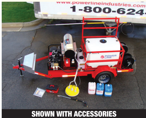
SHOWN WITH ACCESSORIES

Gas Engine • Diesel Heated HOT/COLD/STEAM PRESSURE WASHER Single Axle Series