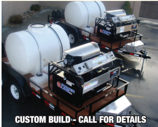
CUSTOM BUILD - CALL FOR DETAILS

Diesel Engine • Diesel Heated HOT/COLD/STEAM PRESSURE WASHER Diesel Series